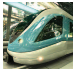
Dubai Metro Red Line

Transys Projects provide significant engineering support for OEMs Worldwide.